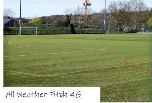
All Weather Pitch 4G