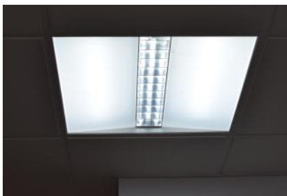
Old Fluorescent Lighting