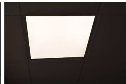
New LED Lighting Panels